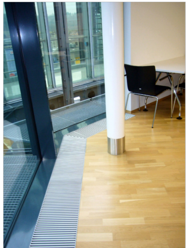
Installation example, with LTG aluminum roller grille