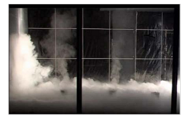
Room air flow

The high-induction linear diffuser splits the supply air in diverging individual jets in a localized manner in parallel to the facade. Air speed and temperature differential are reduced rapidly. In the cooling mode, the air jets' limited divergence creates a mixed air stream close to the facade or wall, forming a low level displacement flow in the occupied zone. This flow replaces air that "plumes" to high level from heat sources and occupants. In the heating mode, the chilled indoor air close to the floor is rapidly mixed with the heated supply air thanks to high induction. The integrated heat exchanger (version including reheating, type LDU-W/H) has been optimized specifically for low water volumes and high caloric outputs.